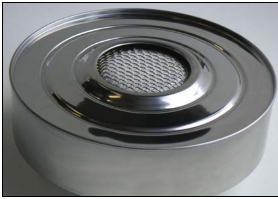
Figure 3: Fuel canister