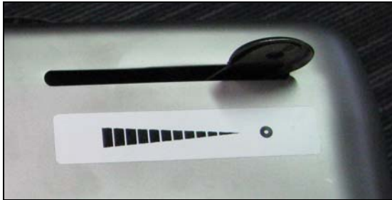
Figure 4: On/off control