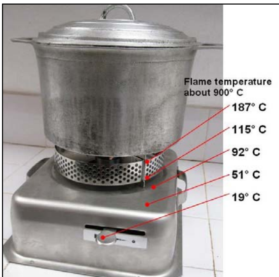
Figure 6: Stove operating temperatures

Figure 3 shows the fuel canister. Note the contour around the canister mouth and that it is raised. The regulator plate slides securely over the canister mouth to extinguish the flame and close the canister so that the fuel cannot evaporate.