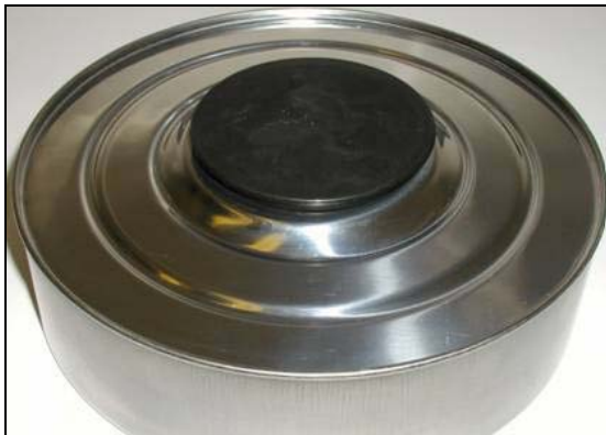
Figure 5: Pop-on cap for fuel storage