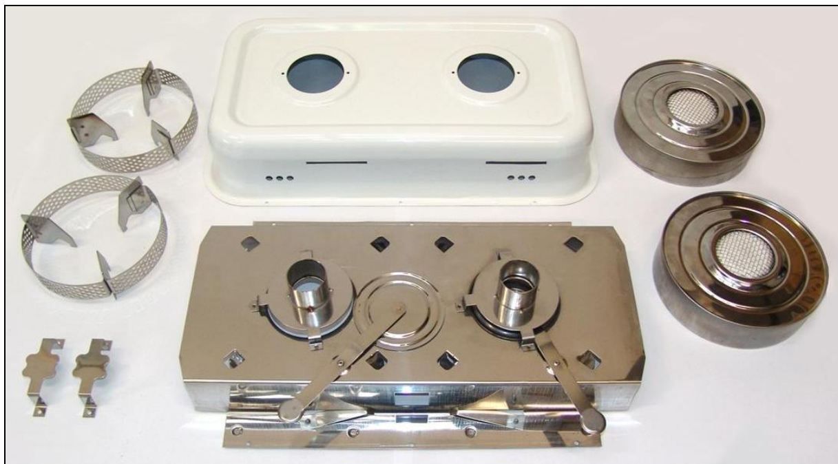
Figure 8: Double burner stove ready for assembly